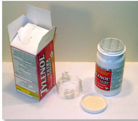
The Tylenol crisis in the US was a wake-up call for pharmaceutical and food companies. This prompted the introduction of plastic banding seals around screw lids and also internal foil safety seals to combat any tampering with products.

The second level of security or closure, which may take the form of an inner 'foil' or polymer film adhered to the edge of the container lid, usually has a dual purpose. Firstly the drug material is sealed and contained and will not spill out – this can also ensure that the material is sealed under inert atmosphere and so protected from oxidation or degradation during transport. Secondly, evidence of tampering via this route can be immediately recognised as the seal around the edge has been broken.